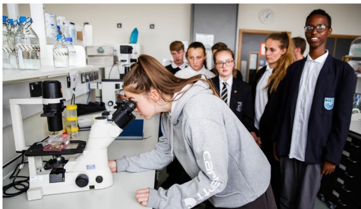
The Trust's Future Brunels programme

There's always a wealth of rich content and collections to explore and delve deeper into that encourages learning and builds knowledge. The Reality is often more fascinating than the myth. New stories are added to the familiar, and our understanding changes all the time. Finding out new things and relating stories new and old to audiences of all backgrounds is alluring and attractive to the storyteller and to the listener/viewer/participant.